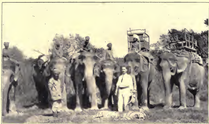
THE TIGER'S LYING IN STATE.